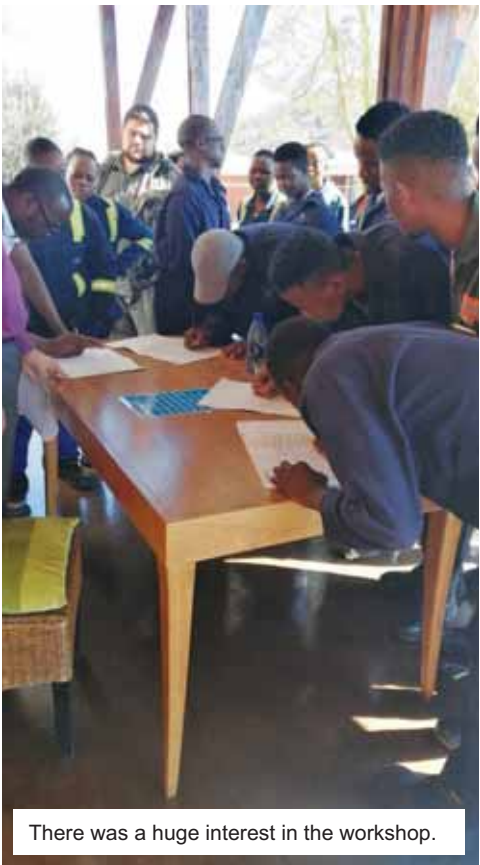
There was a huge interest in the workshop.